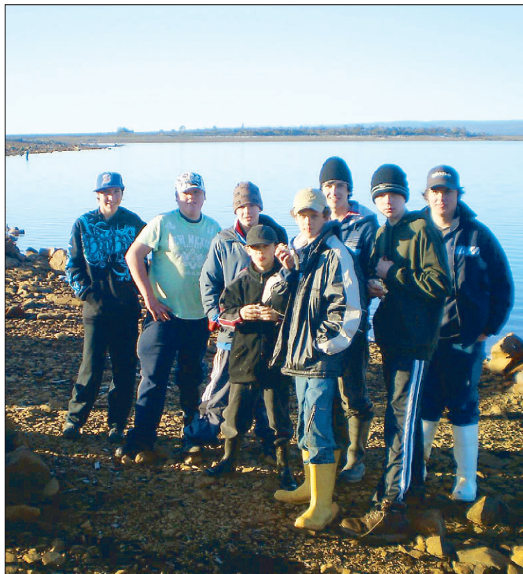
FUTURE: Personalised learning opportunities for students included a fly-tying business venture.

MOST Grade 10 students are yet to decide what career path they will choose, so the best way to help them decide is a work experience program.