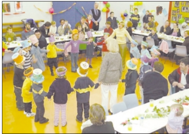
HEALTHY ENTHUSIASM: Kinder kids enjoy their banquet.