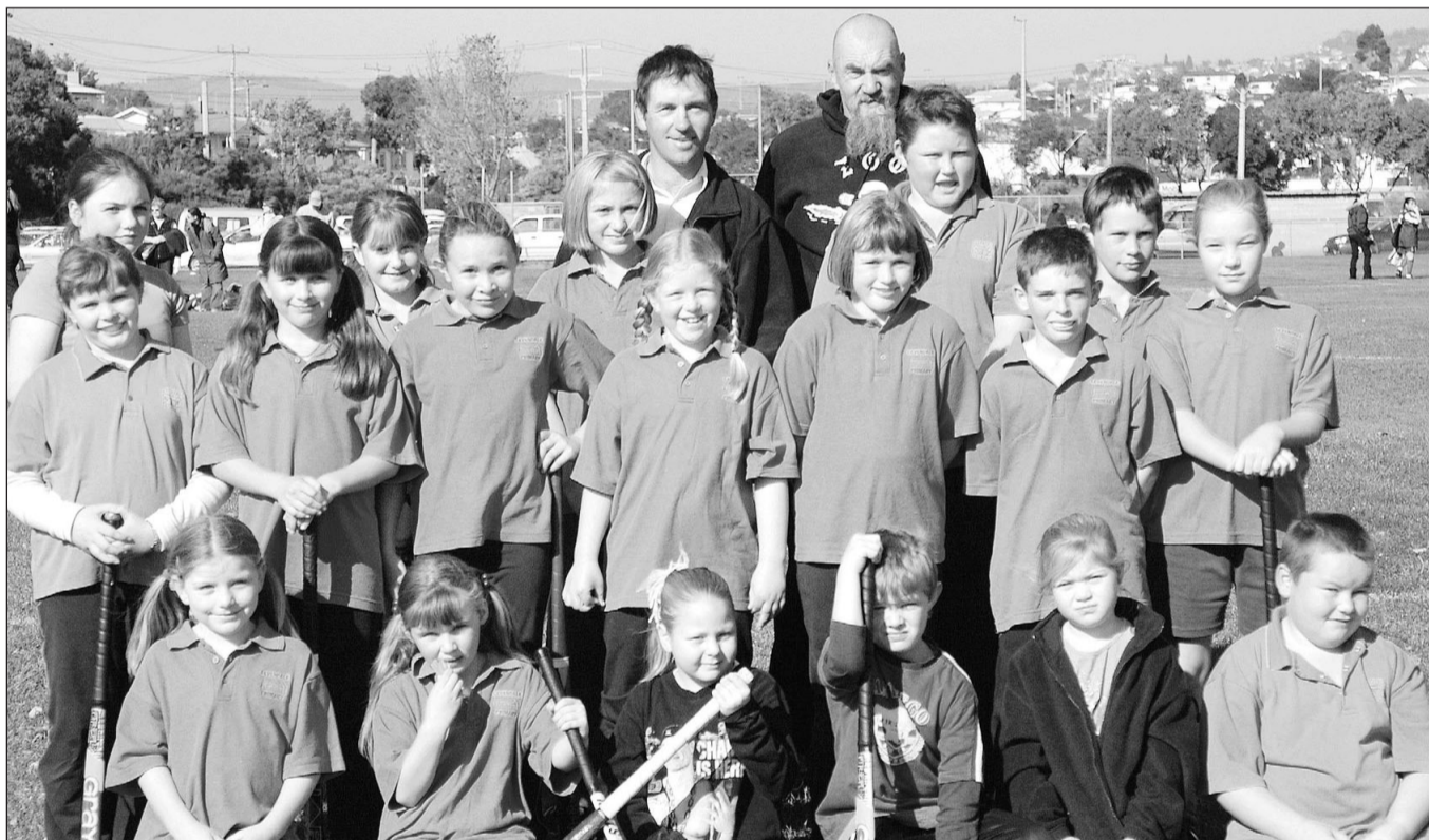
A WINNING TEAM: Levendale Primary School hockey representatives.

I think that is because we spend so much time training together.