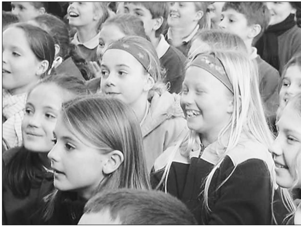
AUDIENCE PARTICIPATION: Over four days, a total of 900 people watched the talent quest.

All participants did a great job and next year's shows are eagerly anticipated.