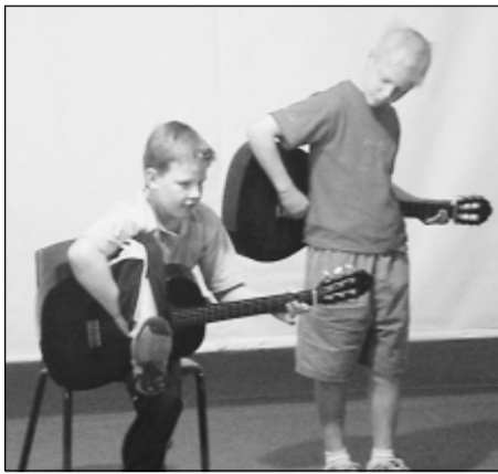
PLUCKY: Entrants show their guitar style.

was very brave doing lots of fantastic bike stunts in front of a hard-to-please crowd, earning himself a big round of applause from the audience.