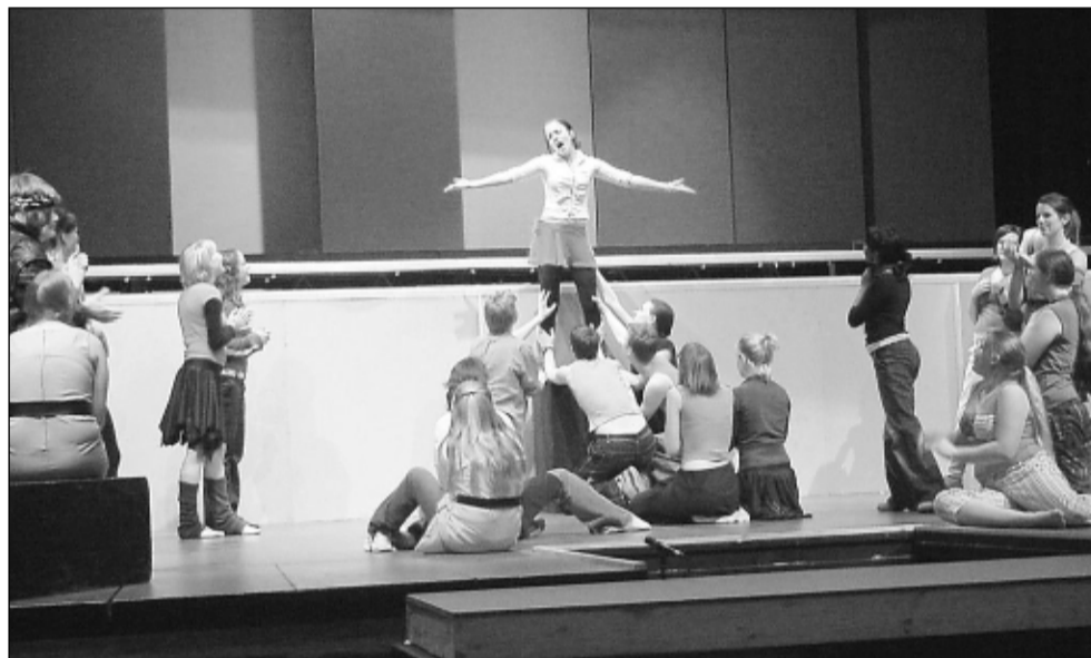
ALMOST FAMOUS: A big scene from Hobart College's current stage production, Fame .