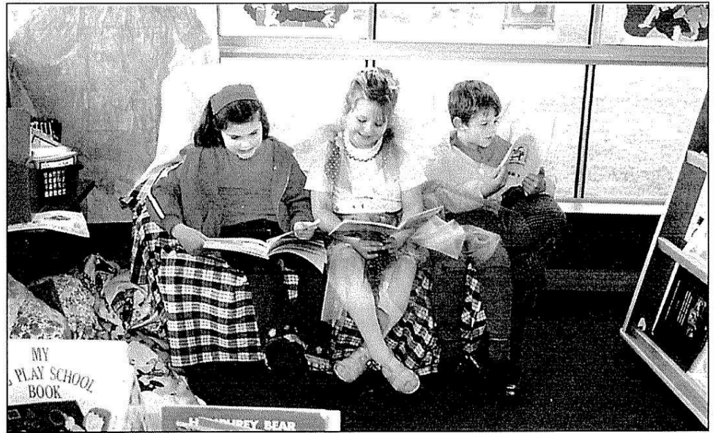
EASY TRANSITION: Hilliard kindergarten makes starting school an enjoyable experience.

A new modern building complete with a kitchenette offers a spacious environment for learning. In this safe, happy environment with friendly teachers and students, the children are sure to adjust to school and learn at their own level and pace while gently being encouraged to broaden their knowledge and improve their skills.