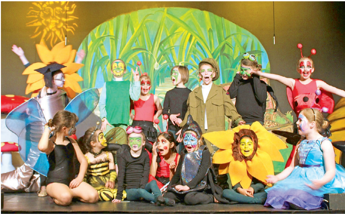
CLASS ACT: Grade 2 students in the Fahan School musical production of Bugs .