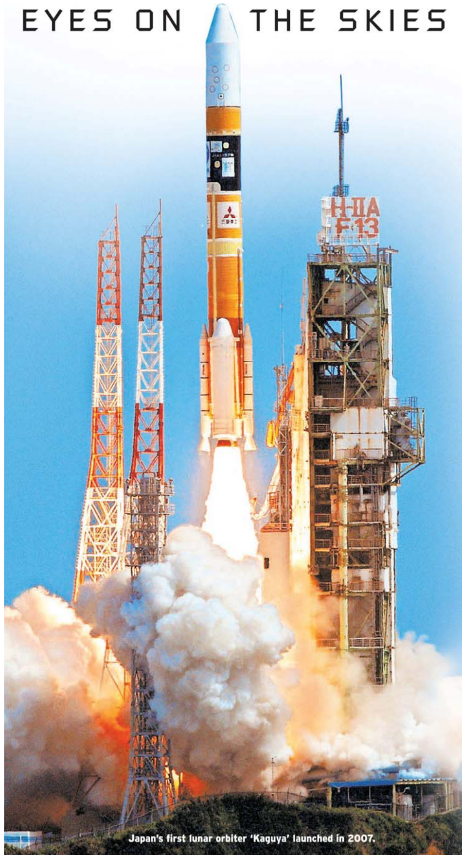
Japan's first lunar orbiter 'Kaguya' launched in 2007.

SOPHISTICATED PROBES ARE SLOWLY REVEALING THE SECRETS OF THE UNIVERSE