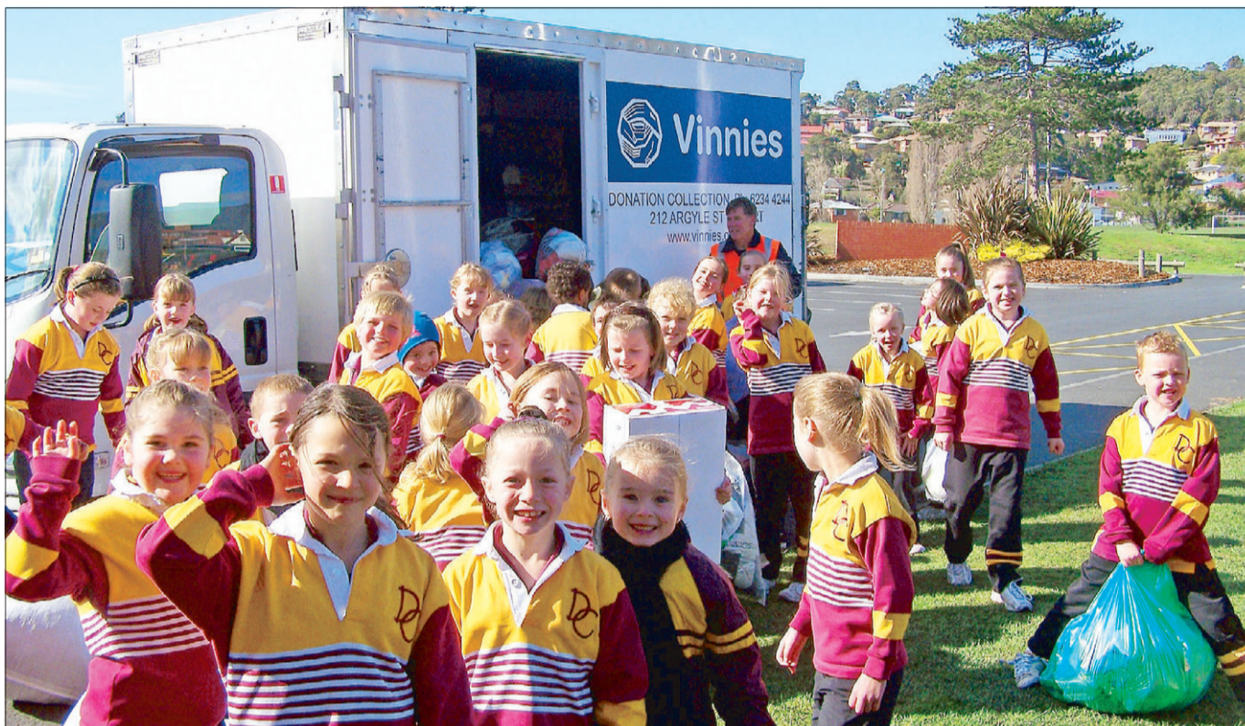
BIG HEARTS: Dominic College students show their support for a clothing drive for Vinnies.

There are also Vinnies bins on the old primary campus in Bowden St, Glenorchy, which is now Guilford Young College.