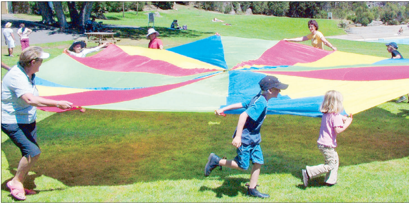
TOGETHERNESS: Students of Distance Education Tasmania at a "welcome day" earlier this year.