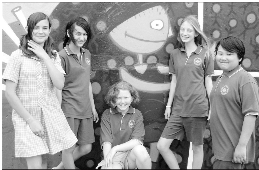
WALL TO WALL: The Mural is the culmination of a joint New Town High/Bowen Road project.

Cooking activities and learning through game playing have also been effective in meeting the goals we set for ourselves.